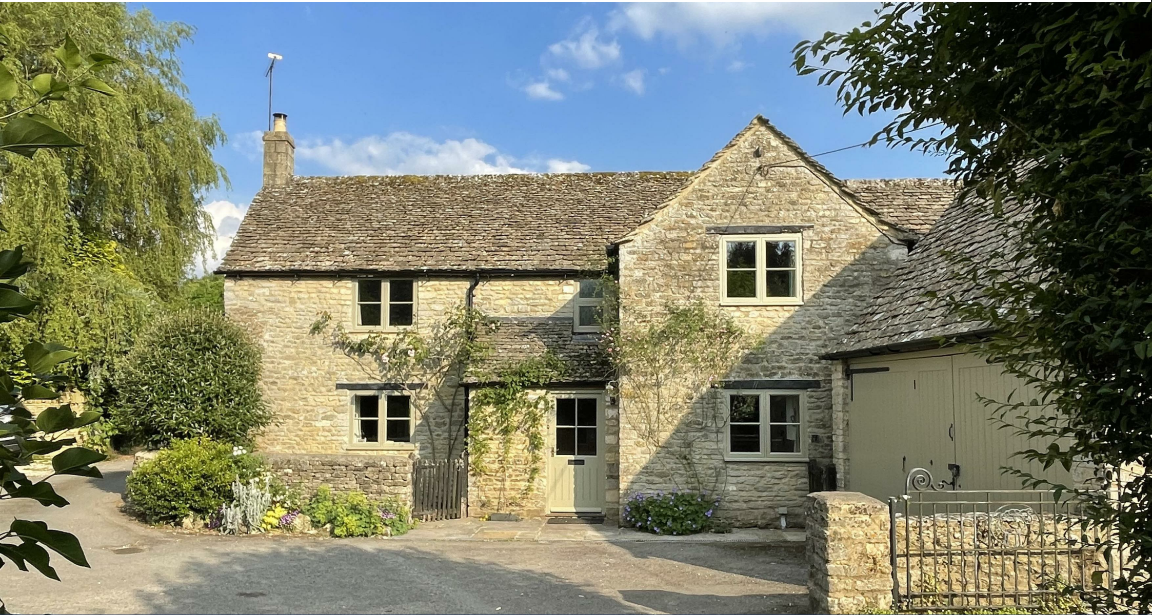
Sparrow's Cottage Eastington, Cheltenham, GL54 3PN Guide Price £740,000